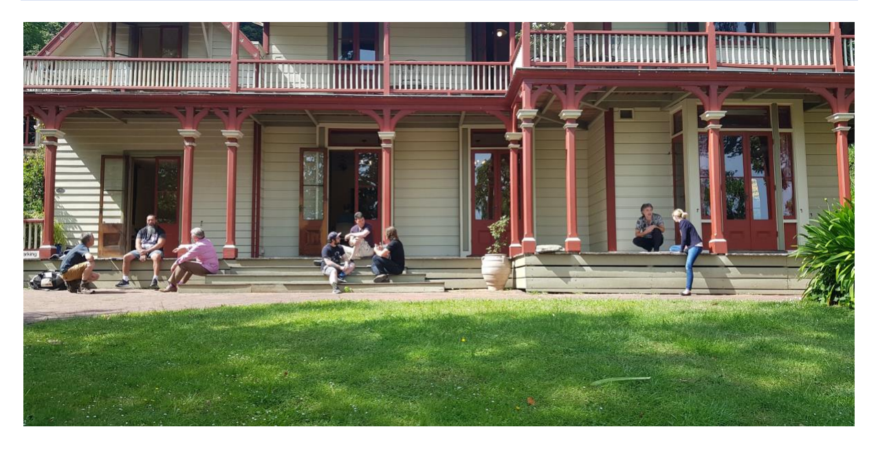
Group breakout session at MSA's IPS Training HQ - the beautifully restored Fairfield House in Nelson